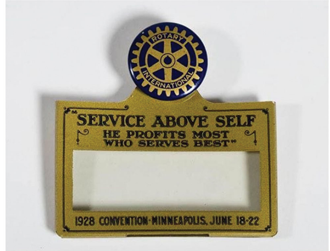
A name badge from the 1928 Rotary convention features both mottos